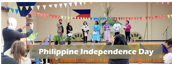
Philippine Independence Day