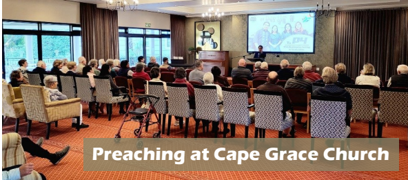
Preaching at Cape Grace Church