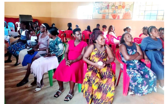
AGC women and visitors playing musical chairs in their indoor evangelism program