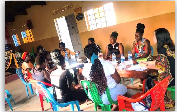
AGC Women's Fellowship