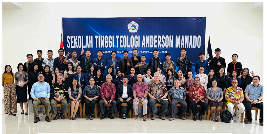
Anderson Theological Seminary Manado