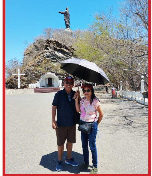
Visiting the iconic Cristo Rey statue above Dili, the capital city.

This will be our first time to spend Christmas and New Year in this new country of ministry. We would like to express our heartfelt gratitude once again to all of you who are praying for us and financially helping us for the Ministry here in East Timor. We would like to share some Praise and Prayer items where you can join us.