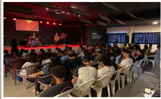
Worship Service at GBC - Ibura