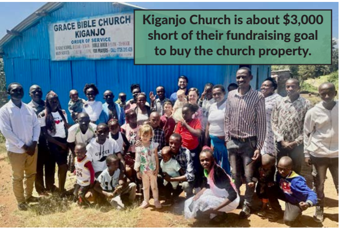
Kiganjo Church is about $3,000 short of their fundraising goal to buy the church property.

waiting for us to raise the money, but it is unclear how long this offer will be on the table. He is asking for 1.4 million Kenya Shillings, which is approximately $10,000. Throughout this year, we have joined hands with the Kiganjo church as they raise money to purchase the property. We and others have shared their stories in the States and received generous donations. Kiganjo has raised about $7,000. Please partner with us in raising the remaining $3,000.