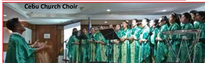
Cebu Church Choir