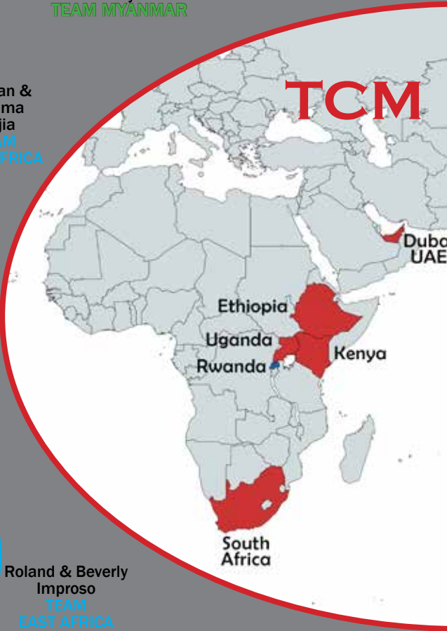
Roland & Beverly Improso TEAM EAST AFRICA