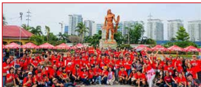
5th Southeast Asia Grace Conference PH 2023