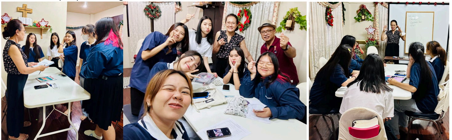
Sowing the Seed of the gospel with Maejo University Students