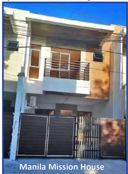
Manila Mission House

Rejoice with us in the Lord's guidance and provision in establishing the Manila Mission House! It is already being put to good use (despite being only partially furnished—see "How Can I Help?" p. 23) and we trust it will facilitate the furtherance of mission work in Southeast Asia and around the world. ❖