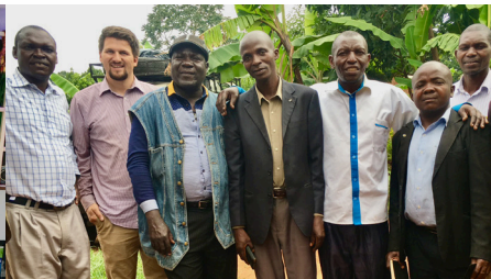
Meeting with Kenyan and Ugandan pastors