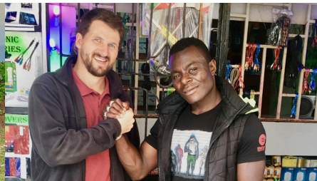
Making friends with shopowner (Church planting in Kayole)