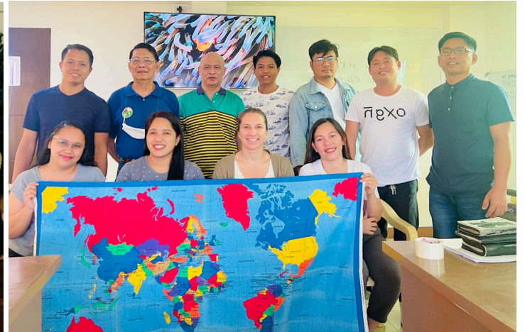
Missionary training in Philippines – June 2022