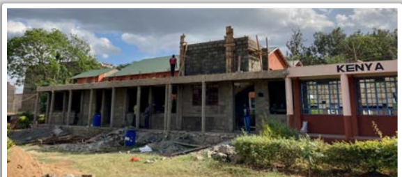
The school building project is continuing, and the end is in sight.