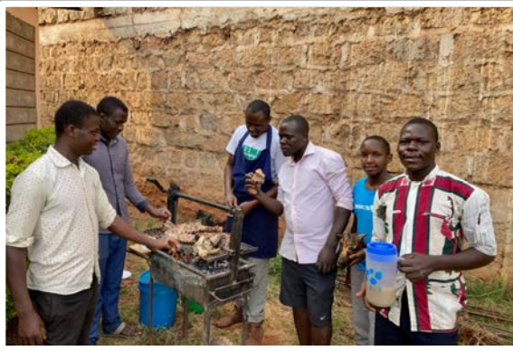
KGBI students roasting a goat for the end of the year party.