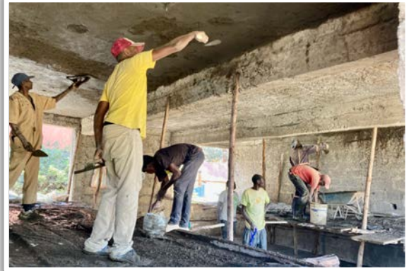
Workers are finishing the inside plaster of the classrooms.

All praise to God for his faithfulness and his faithful givers.