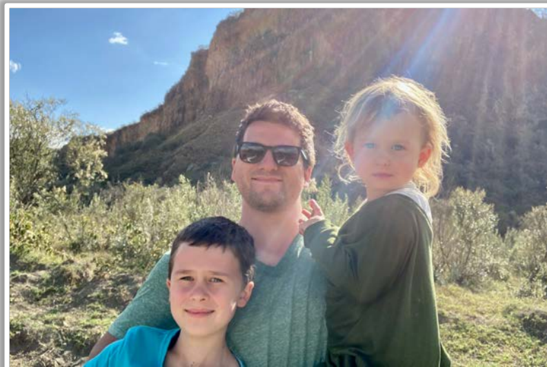
We visited Hell's Gate National Park and enjoyed the beautiful scenery and wildlife. On the right, V stands with the friendly rock hyraxes.