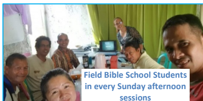
Field Bible School Students in every Sunday afternoon sessions