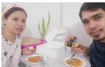
(Enjoying the food given by our contact, who is a doctor in a hospital that tends to COVID patients.)