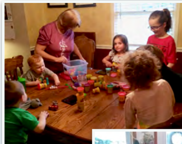
FELLOWSHIPING WITH FAMILY AND FRIENDS