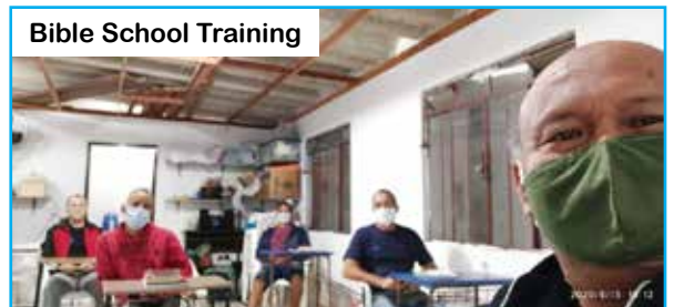
Bible School Training

3. Our Bible School Training: Some trainees are doing their internship this month. There are 7 here in Pontal do Paraná and 10 in the state of Santa Catarina. They just practice social distancing and use masks.