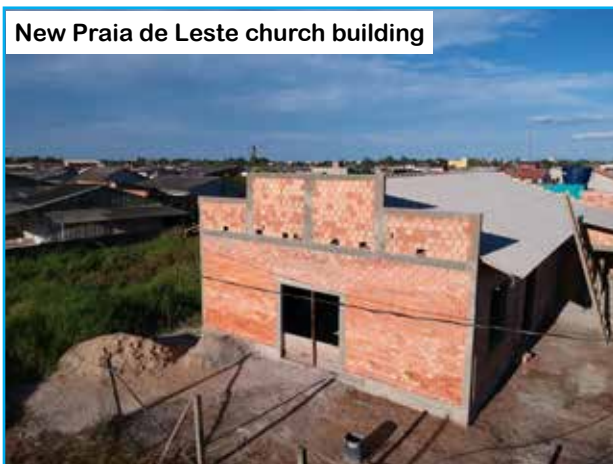
New Praia de Leste church building

4. Last month we had our Dedication and Thanksgiving Service