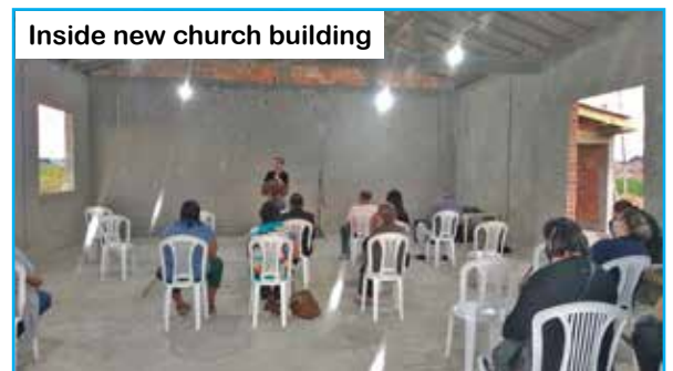
Inside new church building

for one of our church planting projects—a new church building in Praia de Leste. A lot of things are still needed, but at least we can start using the building and stop renting the house.