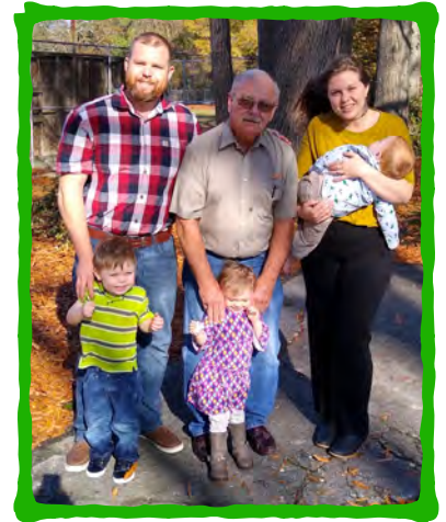
Visiting with one of the members of Grace Bible Church in Thomson, GA.