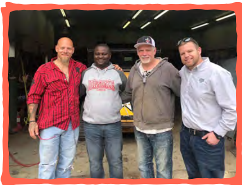
Some new friends we have made along the way.